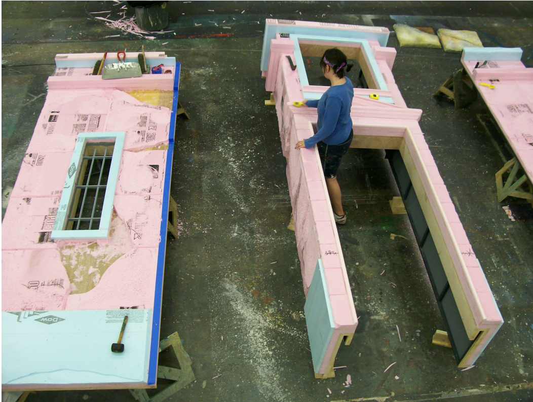
Scenic artists add sheets of foam to the structures, lay out the stones, and begin to carve.