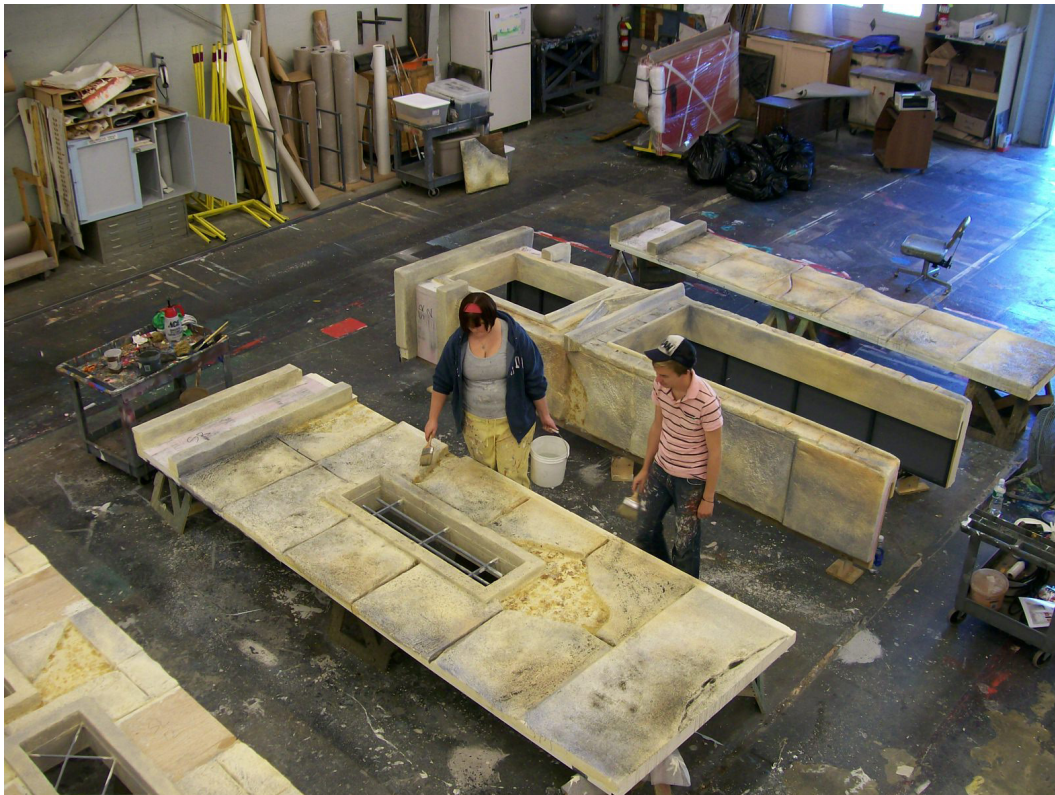
Color is then applied to the stones.