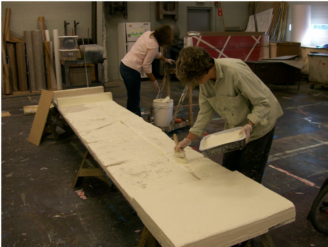
Scenic artists apply a base coat of paint to the stones.