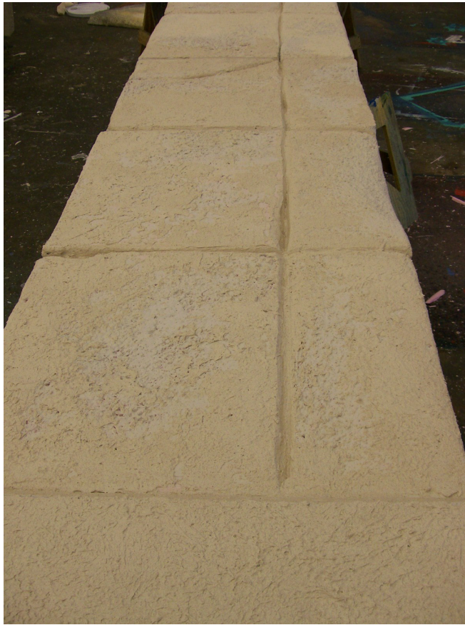
The scenic artists apply more texture and depth to the stones.