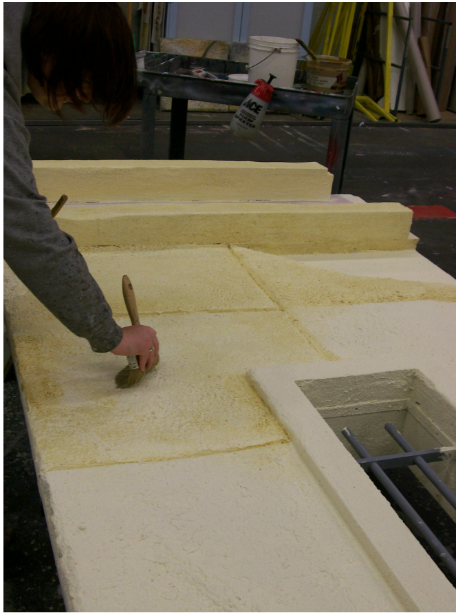
Next, glazes are added to the stones.