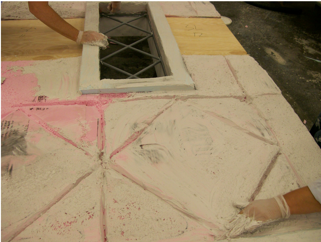
Once the foam is carved the scenic artists apply a layer of Foam Coat to help protect and texturize the foam. Next, a texture mixture is applied consisting of glue and sand.